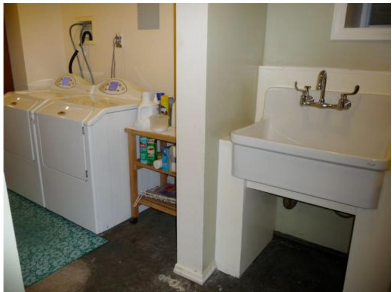
Basement laundry area.