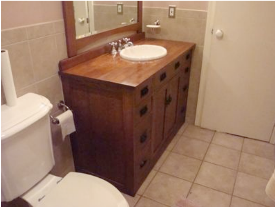
Finished basement bath.