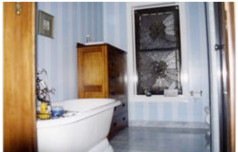
1st floor bath. It has a separate stall shower.