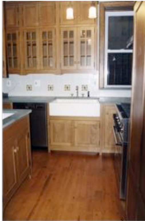
1st floor kitchen