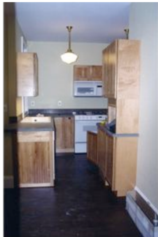
2nd & 3rd floor kitchen, bedrooms, bath and living room are similar. Each with rear bedroom and front bedroom.